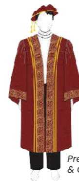
President & CEO