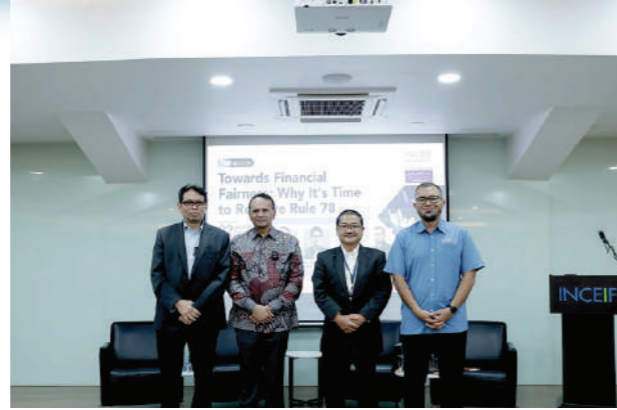
22 January · INCEIF University Campus, Kuala Lumpur

INCEIF University and MATRADE hosted a fireside chat on ESG compliance for SMEs, bringing together industry experts to share strategies for global market access and sustainable growth.