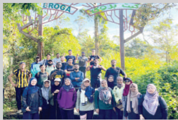
24 February · Gunung Datuk, Negeri Sembilan