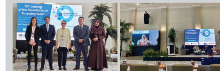
16 April · Jeddah, Saudi Arabia

ISRA Consulting participated in the IsDB Reverse Linkage Mission, sharing Malaysia's expertise to support Brunei's Islamic microfinance ecosystem through the Ar-Rahnu model.