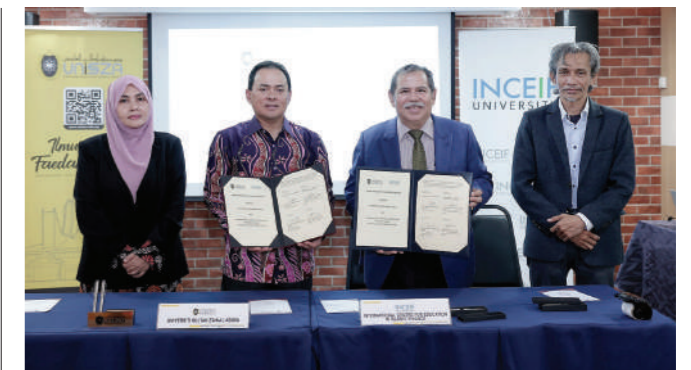
29 August - INCEIF University Campus, Kuala Lumpur

INCEIF University, through ISRA Institute, signed a collaboration agreement with Wanita Berdaya Selangor to champion women's empowerment, support MSMEs and caregivers, and drive care economy innovation in Selangor. This partnership aligns with the state's Care Economy Policy and advances inclusive development through Islamic economics and social finance.