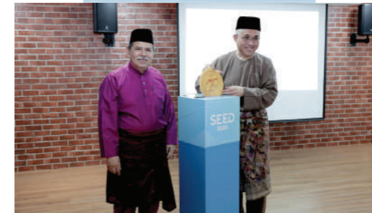
7 March INCEIF University Campus, Kuala Lumpur