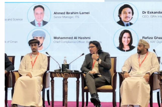
9 September - Grand Hyatt Muscat, Oman