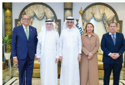
18 February Jeddah, Saudi Arabia