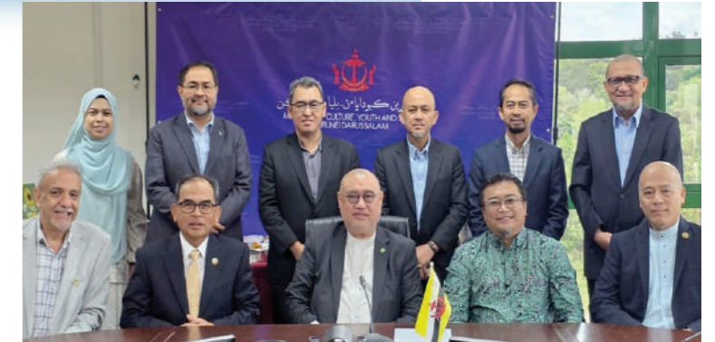
14 April · Bandar Seri Begawan, Brunei Darussalam