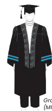
Graduate Student (MIFP/eMIF)