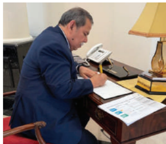
12 August - Istana Negeri Sembilan, Kuala Lumpur