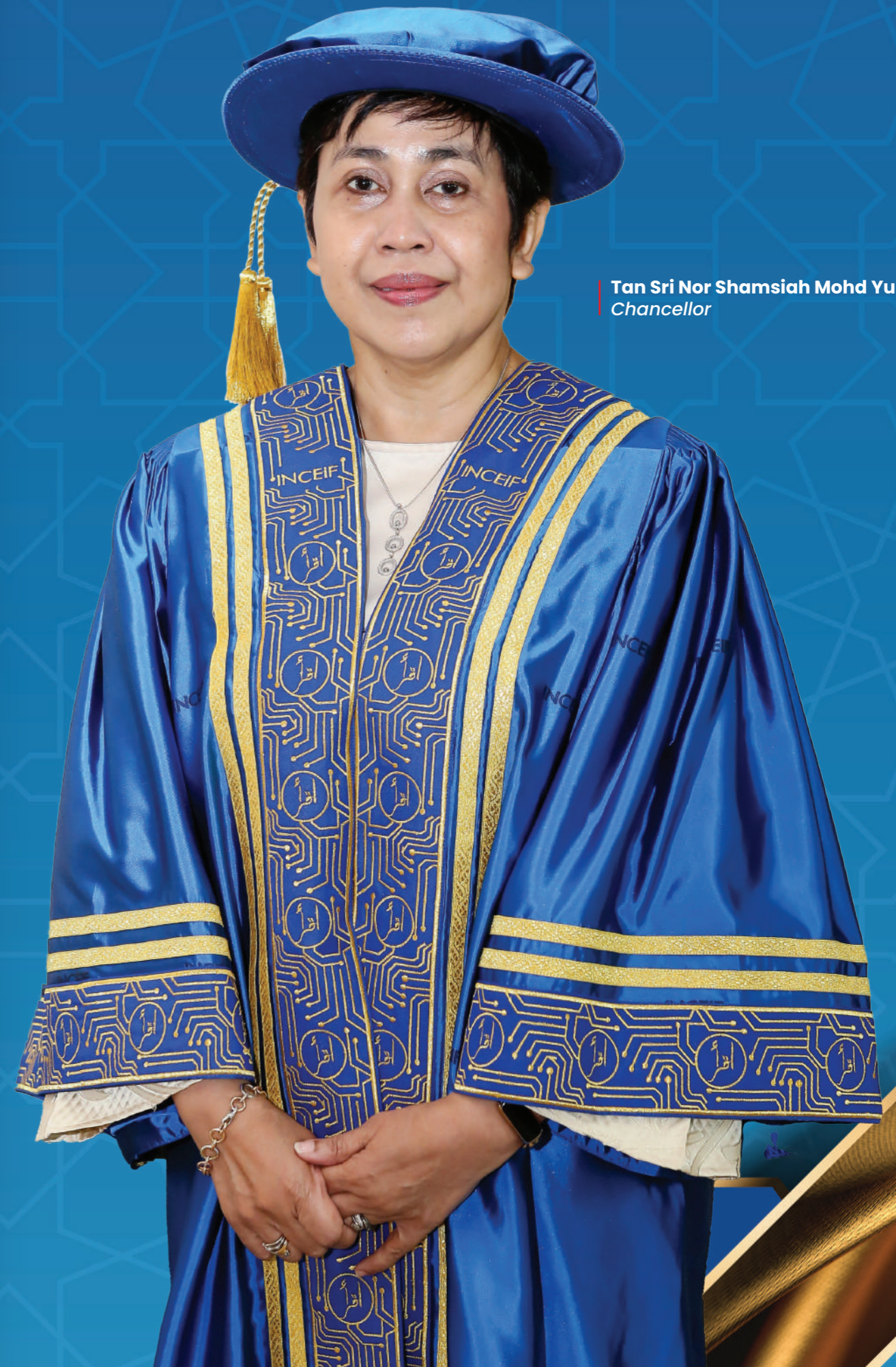
Tan Sri Nor Shamsiah Mohd Yunus Chancellor