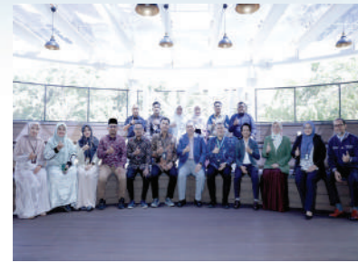
6 August - INCEIF University Campus, Kuala Lumpur