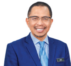
Dato' Seri Ir. Dr Zaini Ujang

Chairman, Malaysian Qualifications Agency