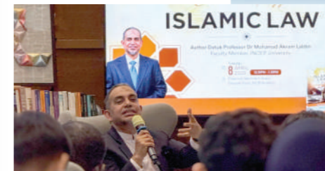
8 April Financial Services Library, Kuala Lumpur