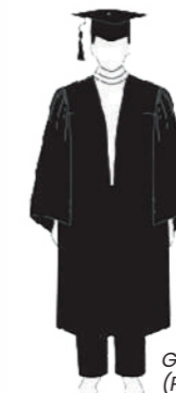
Graduate Student (PCIF/PC MBA)