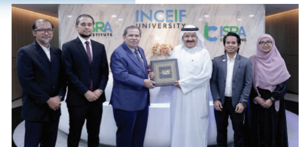
11 September - INCEIF University Campus, Kuala Lumpur