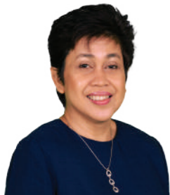
Tan Sri Nor Shamsiah Mohd Yunus

Chairman, World Wide Fund for Nature (WWF) Member of the Association of Chartered Certified Accountants (ACCA, UK), the Institute of Chartered Accountants in England & Wales (ICAEW) and the Malaysian Institute of Accountants (MIA)