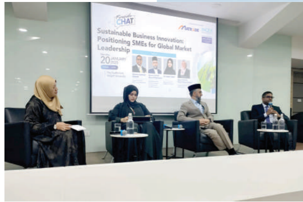
20 January · INCEIF University Campus, Kuala Lumpur

INCEIF University and MATRADE hosted a fireside chat on ESG compliance for SMEs, bringing together industry experts to share strategies for global market access and sustainable growth.