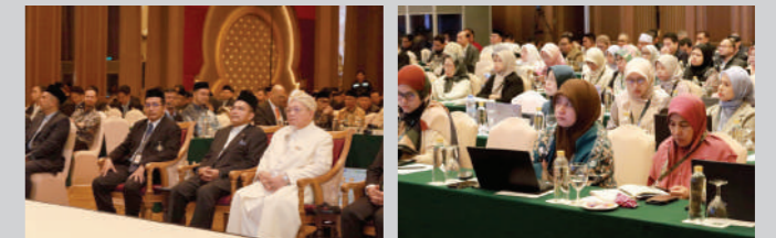
31 July - Kajang, Selangor

INCEIF University's University Social Responsibility unit led a Financial Literacy Programme for Form 4 students at SMK Sultan Abdul Aziz Shah (Integrasi), equipping nearly 100 students with practical financial knowledge and tools. Organised with the Centre of Excellence for Islamic Social Finance and supported by Zurich Takaful Malaysia Berhad, the programme covered budgeting, saving, investment, and fraud awareness, with INCEIF students serving as mentors to inspire responsible financial behaviour among youth.