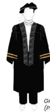
Graduate Student (PhD)