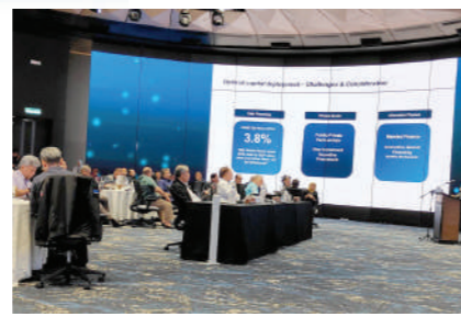
22 February · PETRONAS Leadership Centre, Selangor