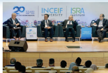
10 June - Sasana Kijang, Kuala Lumpur

YAB Dato' Seri Anwar Ibrahim officiated the launch of i-RISE, the Centre of Excellence for Research and Innovation in Islamic Economics (i-RISE), under INCEIF University's research arm, ISRA Institute. Hosted by INCEIF University and ISRA Institute, the event brought together leading policymakers, regulators, and industry experts to explore ethical, values-based economic models aligned with maqasid al-Shariah.