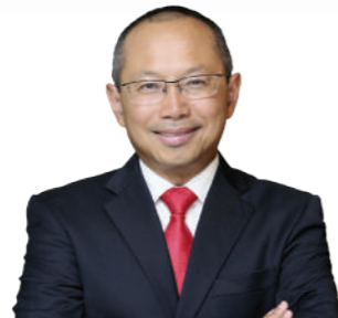
Tan Sri Abdul Wahid Omar

Chairman, World Wide Fund for Nature (WWF) Member of the Association of Chartered Certified Accountants (ACCA, UK), the Institute of Chartered Accountants in England & Wales (ICAEW) and the Malaysian Institute of Accountants (MIA)