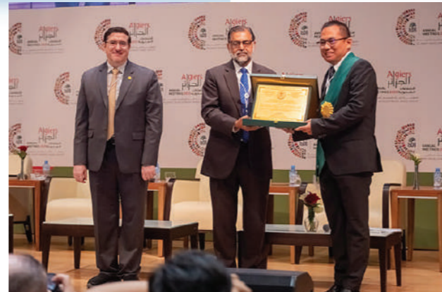
21 May - Algeria

INCEIF University and ISRA Institute, in collaboration with CIMB Islamic, hosted CIMB Cooler Earth 2025, bringing together thought leaders to explore how Islamic finance can drive ethical and impactful sustainability. From carbon markets to Maqasid-driven innovation, the conference called for bold, values-based action in addressing climate and economic challenges.