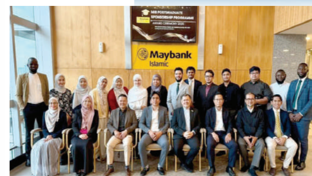
6 August - Maybank, Kuala Lumpur

INCEIF University participated in the Maybank Islamic Postgraduate Sponsorship Programme 2025, with 19 of the 37 recipients being INCEIF students. This collaboration reflects a shared commitment to nurturing ethical, professional, and globally competent talent to drive innovation and sustainability in the Islamic financial ecosystem.