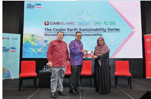
20 May - Kuala Lumpur

INCEIF University and ISRA Institute, in collaboration with CIMB Islamic, hosted CIMB Cooler Earth 2025, bringing together thought leaders to explore how Islamic finance can drive ethical and impactful sustainability. From carbon markets to Maqasid-driven innovation, the conference called for bold, values-based action in addressing climate and economic challenges.