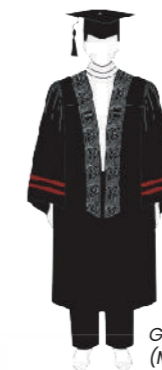
Graduate Student (MSc/MBA)