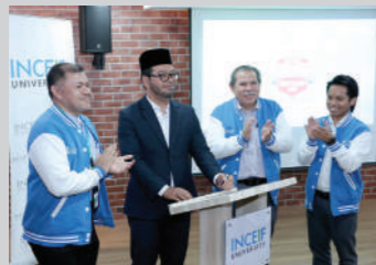
28 June - INCEIF University Campus, Kuala Lumpur

The Islamic Finance Future Leaders Bootcamp 2025 was launched by YB Senator Dr Zulkifli Hasan, Deputy Minister in the Prime Minister's Department (Religious Affairs). A total of 50 students from 11 universities across Malaysia participated in two days of intensive learning, industry insights, and leadership development, bridging academic theory with real-world Islamic finance applications.