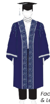
Faculty Professor & Lecturer